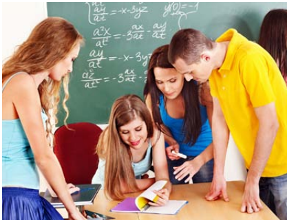
Indoor air quality