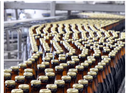
Leak monitoring in filling plants (safety)