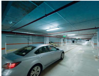
Monitoring in underground garages (safety)