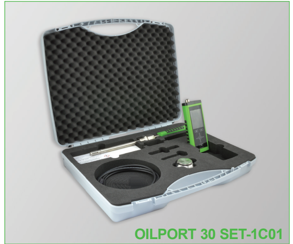
OILPORT 30 SET-1C01

The optional calibration kit is used for easy 1 and 2 point adjustment of the a_w reading.